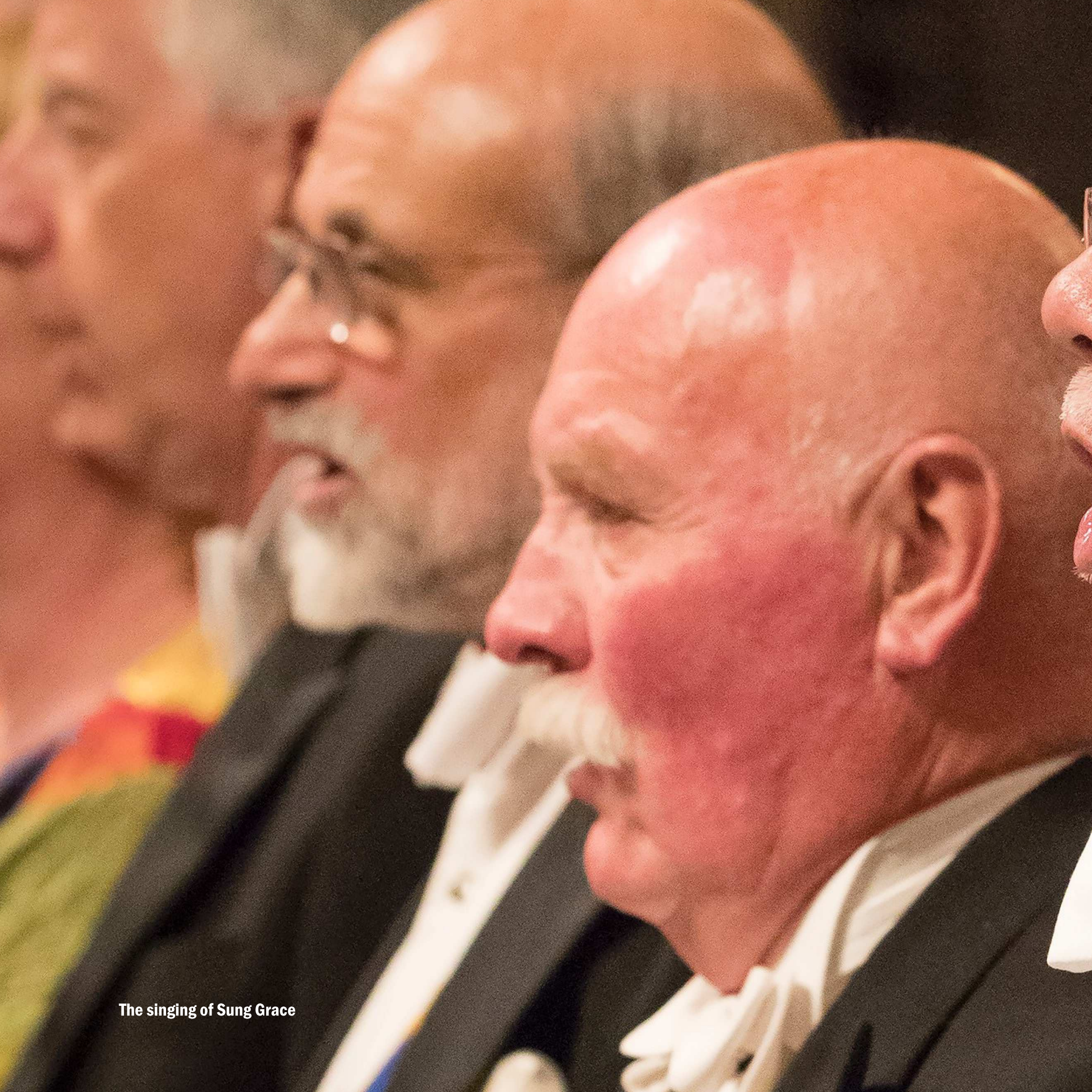
The singing of Sung Grace